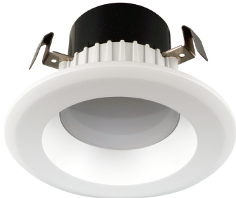
120V Triac Dimming Ver.