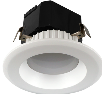
120-277V 0-10V Dimming Ver.